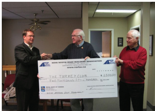
NSRBA 2010 Turkey Club Donation - Thanks to all our sponsors!!