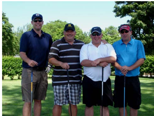
Thanks to all our sponsors for their generous donations to the 2010 NSRBA Golf Tournament on July 9th!

The NSRBA takes great pride in supporting charitable initiatives. We are able to make these donations because of the great support and generosity of our members. Thanks so much to each one of you.