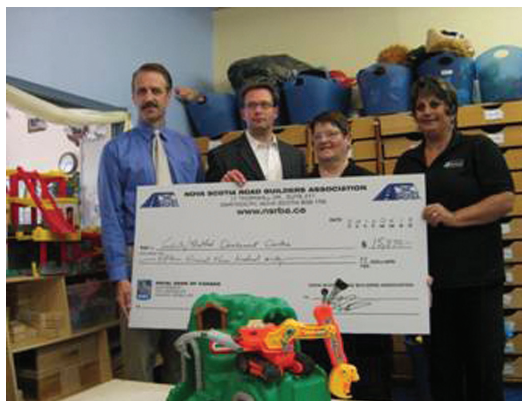
NSRBA 2010 Donation to the Sackville Bedford Developmental Centre