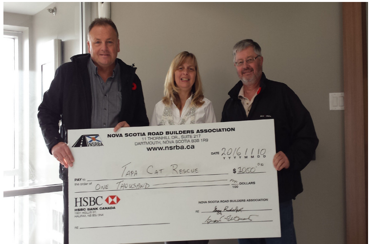
TAPA Cat Rescue Society

Additionally in 2016 the NSRBA also made a $1000 donation last year to TAPA Cat Rescue Society, ensuring its charity extends not only to the residents of the province but to animal friends as well!