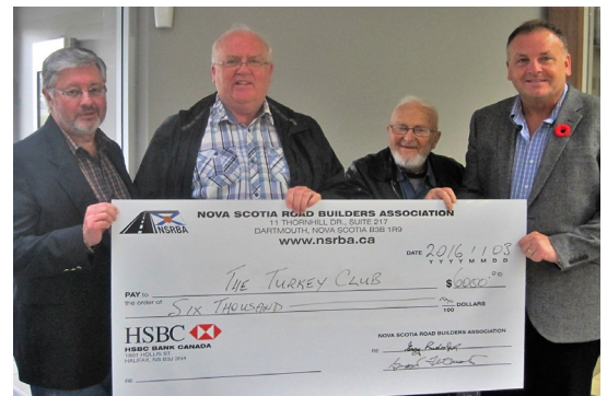
NSRBA 2016 Turkey Club Donation - Thanks to all our sponsors!!