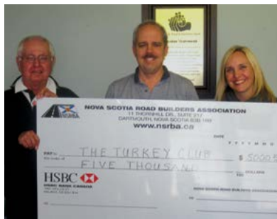
NSRBA 2015 Turkey Club Donation - Thanks to all our sponsors!!

The NSRBA takes great pride in supporting charitable initiatives. We are able to make these donations because of the great support and generosity of our members. Thanks so much to each one of you.