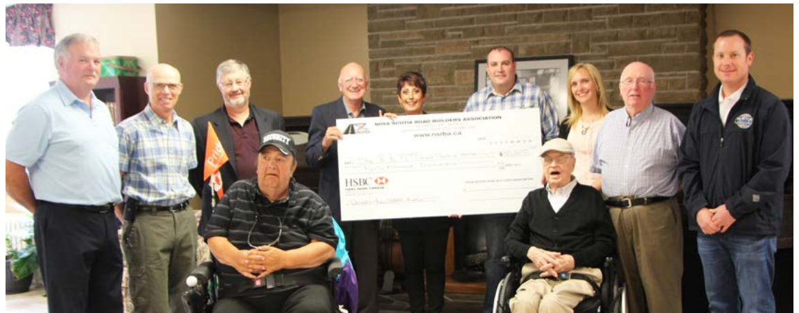
The Nova Scotia Road Builders Association made a $40,200 donation to the R.K. MacDonald Nursing Home.