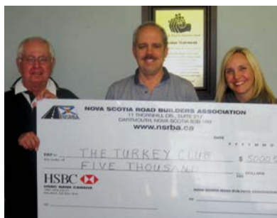
NSRBA 2015 Turkey Club Donation - Thanks to all our sponsors!!

The NSRBA takes great pride in supporting charitable initiatives. We are able to make these donations because of the great support and generosity of our members. Thanks so much to each one of you.