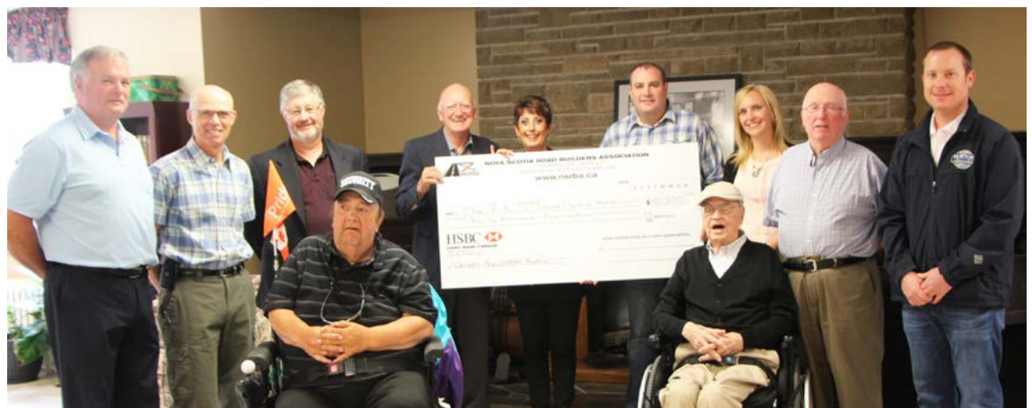
The Nova Scotia Road Builders Association made a $40,200 donation to the R.K. MacDonald Nursing Home.